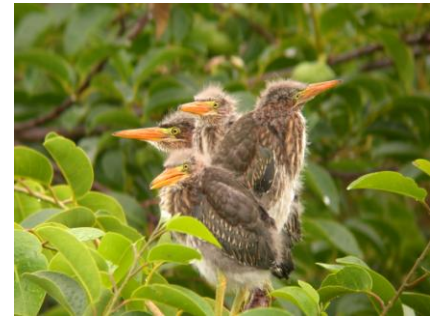
Infant Green Herons Waiting to be Fed

Tuesday, June 9, 2015 7:00 Social; 7:30 Program Padilla Bay Interpretive Center 10441 Bayview-Edison Road Mt. Vernon, Washington