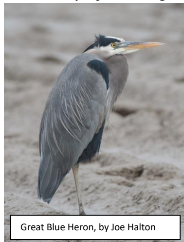
Great Blue Heron, by Joe Halton

In Olympia, Washington, the State Legislature is in the midst of its fast-paced 105-day session, slated to finish in early April. The legislature's composition now offers real opportunity for passage of significant