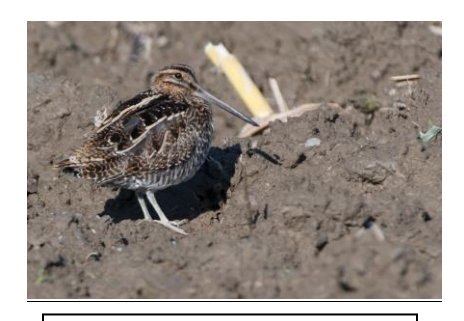
Wilson's Snipe