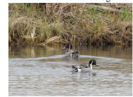
Northern Pintail, by Mary Sinker

<u>http://www.audubon.org/conservation/advocacy</u> and take the suggested action. Then please sign up for Audubon action alerts.