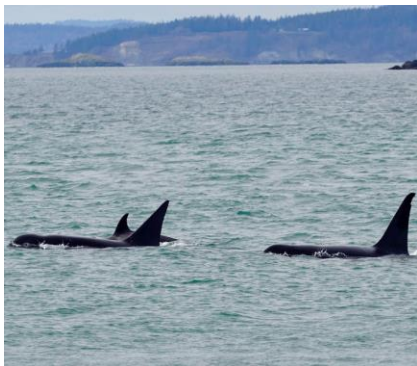
Transient Orca Family off Burrows Island