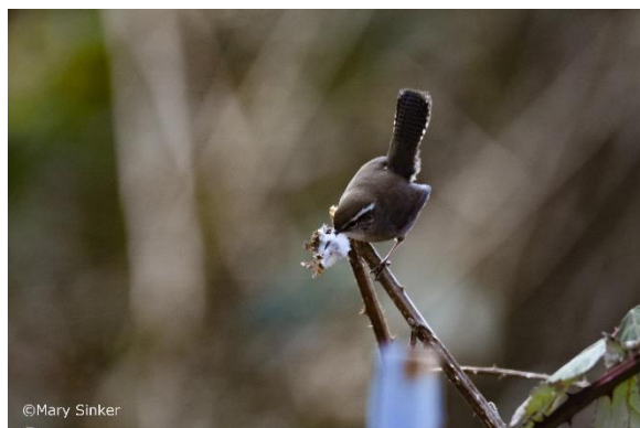
Bewick's Wren with nesting material