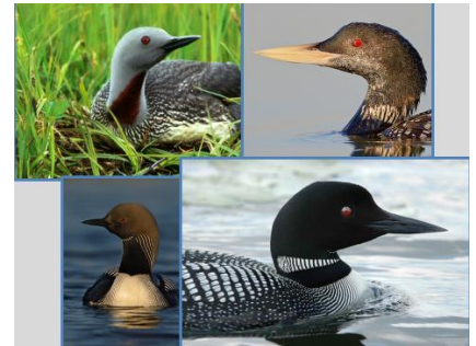
Upper Left to Right: Red-throated Loon Yellow-billed Loon Lower Left to Right: Pacific Loon, Common Loon

Four species of loons grace our local waters: Common Loon, Pacific Loon, Red-throated Loon, and Yellow-billed Loon.