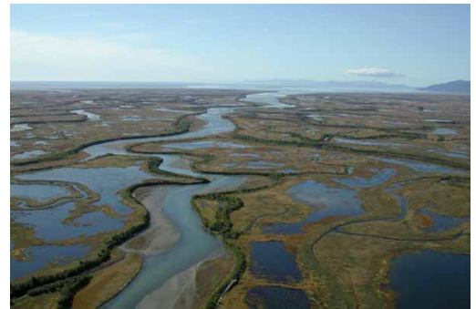
Copper River Delta

Tuesday, June 12, 2012 7:00 Social; 7:30 Program Padilla Bay Interpretive Center 10441 Bayview-Edison Road Mount Vernon, Washington